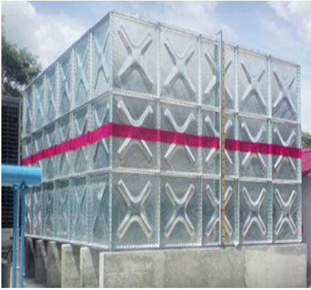
SECTIONAL STEEL TANK HOT DIPPED GALVANIZED STEEL TANK