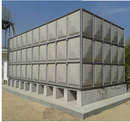
SECTIONAL GRP TANK SANGWON ( ONE TANK)