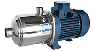
MATRIX Horizontal Multistage Pumps