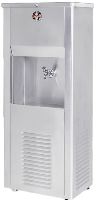
2 TAP - 3 TAP - 4 TAP Water Cooler