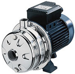
CD-CDX(L) - 2CDX(L) Centrifugal Pumps