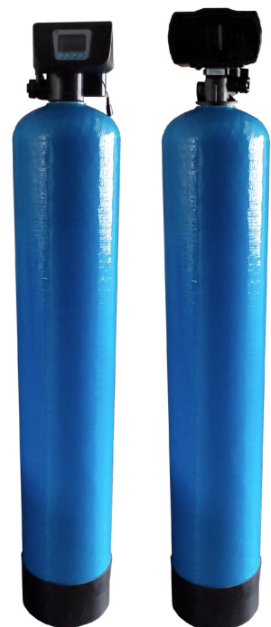
MULTI MEDIA SYSTEM