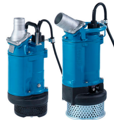
ELECTRICAL Dewatering Pump