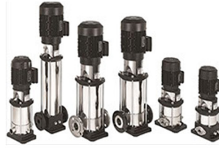
EVMS- EVM - HVM Vertical Multistage Pumps