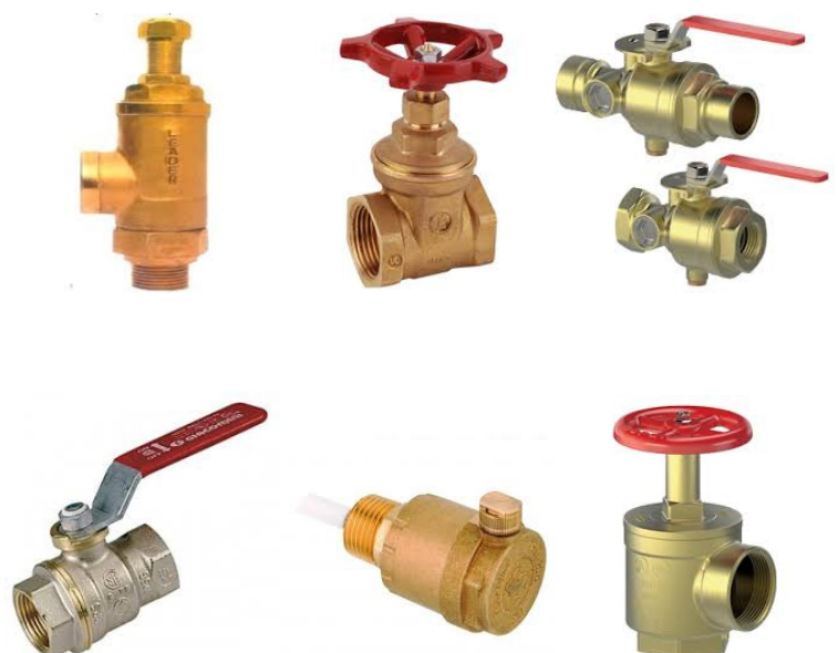
VALVES AND DRAIN COCKS