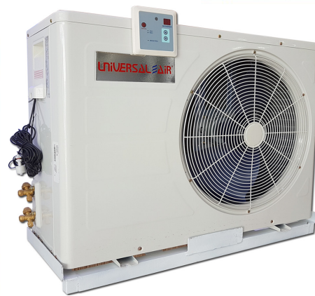
CHILLER 2 Ton COIL TYPE Tank Water Chiller