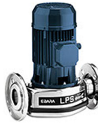
LPS In Line Centrifugal Pumps