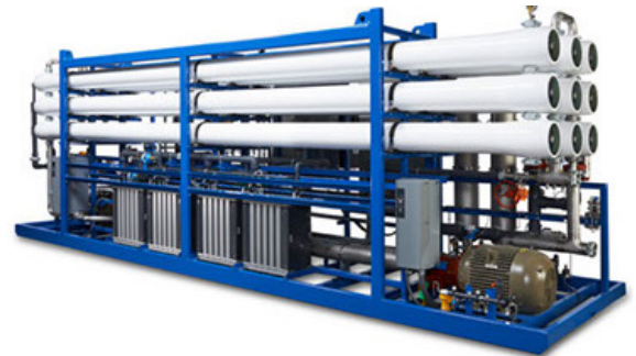
RO-EDI WATER TREATMENT SYSTEM