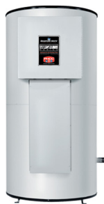
COMMERCIAL Floor Standing