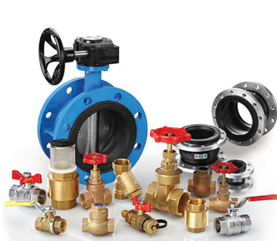
VALVES, FITTINGS AND ACCESSORIES