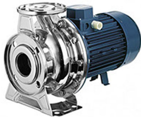
3(L) SERIES Centrifugal Pumps