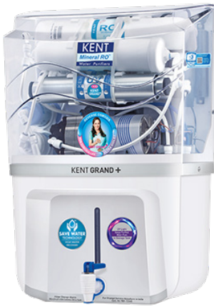
KENT GRAND +