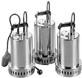
BEST 1-2-3-4-5 Submersible Sump Pumps