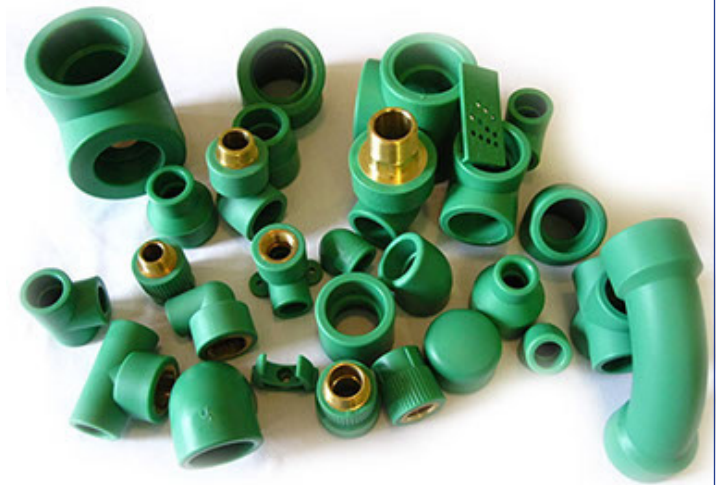
PPR PIPE AND FITTINGS