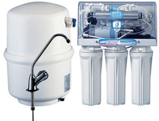
KENT EXCELL +