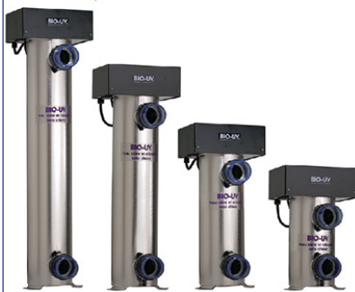
BIO UV STERILLISER