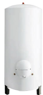
COMMERCIAL Floor Standing