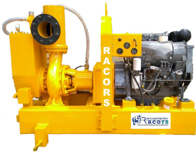
6" Dewatering Pump