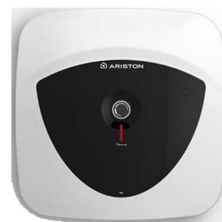
RESIDENTIAL Wall Hung