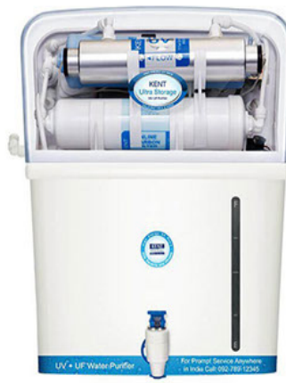
KENT ULTRA STORAGE