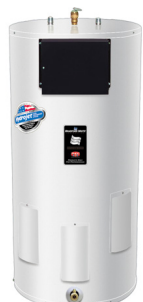
MEDIUM DUTY Floor Standing