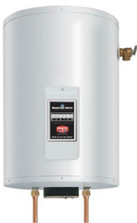
RESIDENTIAL Wall Hung