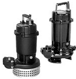
D SERIES Submersible Sewage Pumps