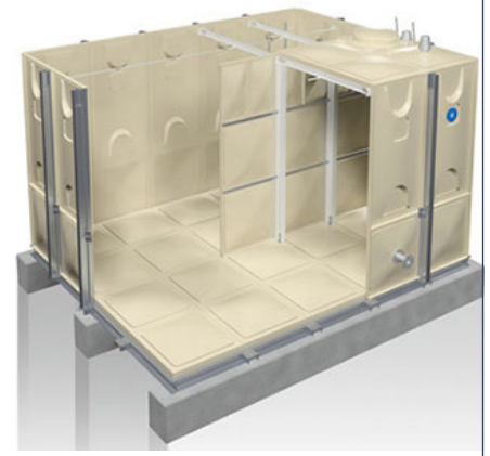
SECTIONAL GRP TANK MITSUBISHI (HISHI)