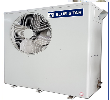
CHILLER 2 Ton - 21 Ton CIRCULATION TYPE Tank Water Chiller