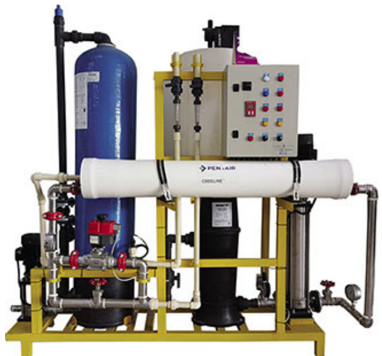
Arabi Company RO WATER TREATMENT SYSTEM