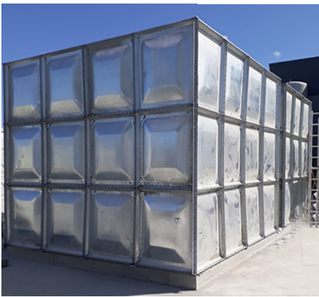
SECTIONAL STEEL TANK HOT DIPPED GALVANIZED STEEL TANK