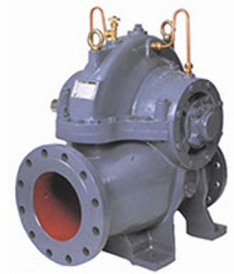
CSA/CNA Split Casing Pumps